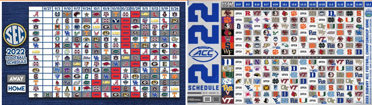
Complete Game Schedule NCAA Football Schedule - Week 1.docx