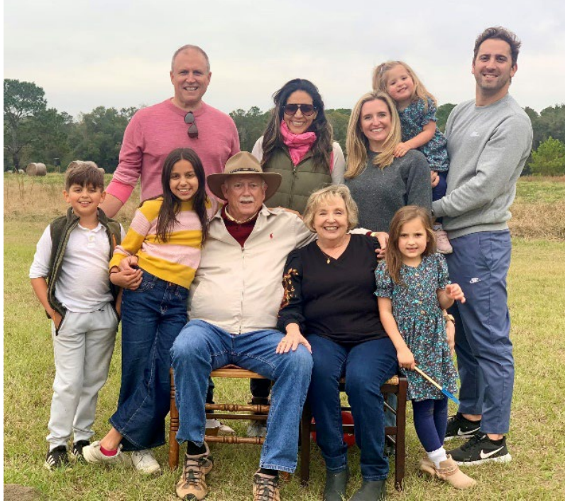
Great Thanksgiving with the family! Go Noles!